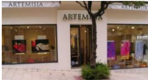
Monte Carlo hosts "Passion for Life" art exhibition supporting GEMLUC