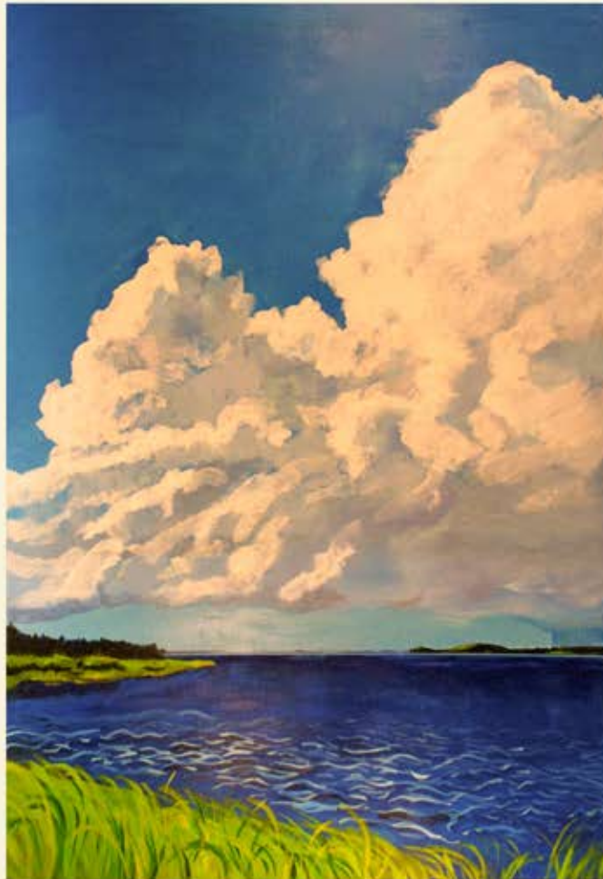
"CLOUD MAGIC" 2018

ACRYLIC ON CANVAS 121.9 cm (W) x 182.9 cm (H)