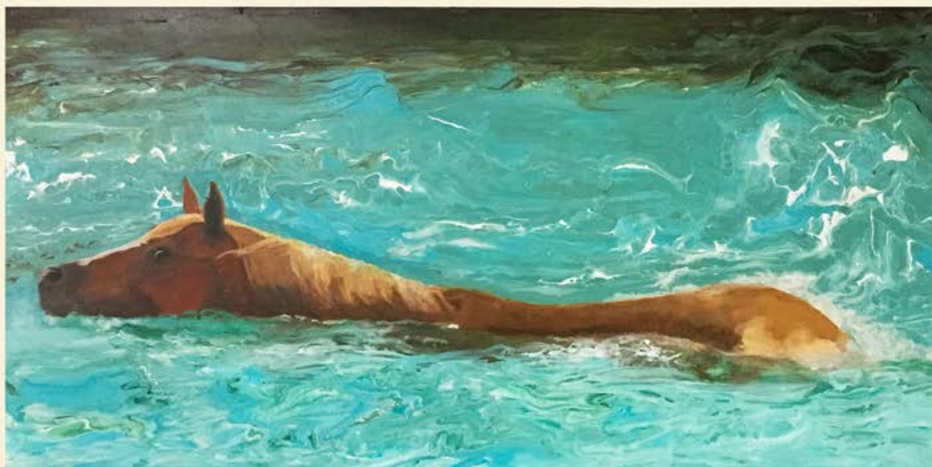
"HORSES NEED WATER TOO" 2018