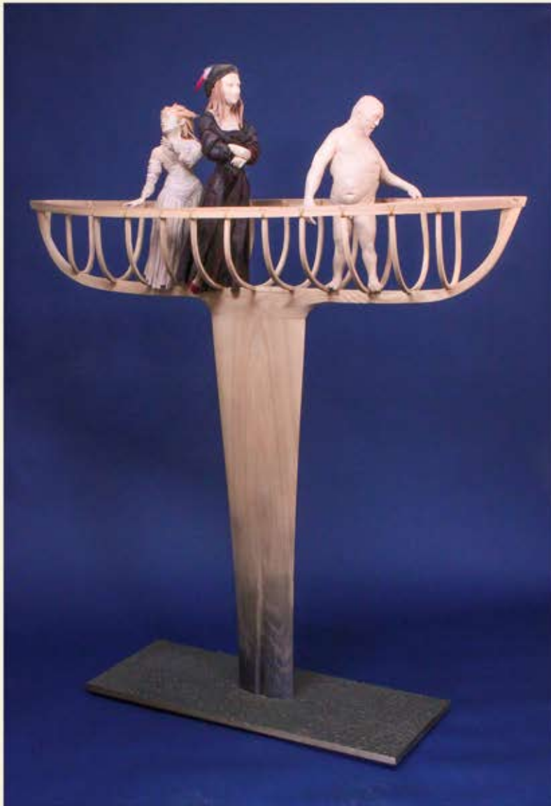
"THREE IN A BOAT" 2015