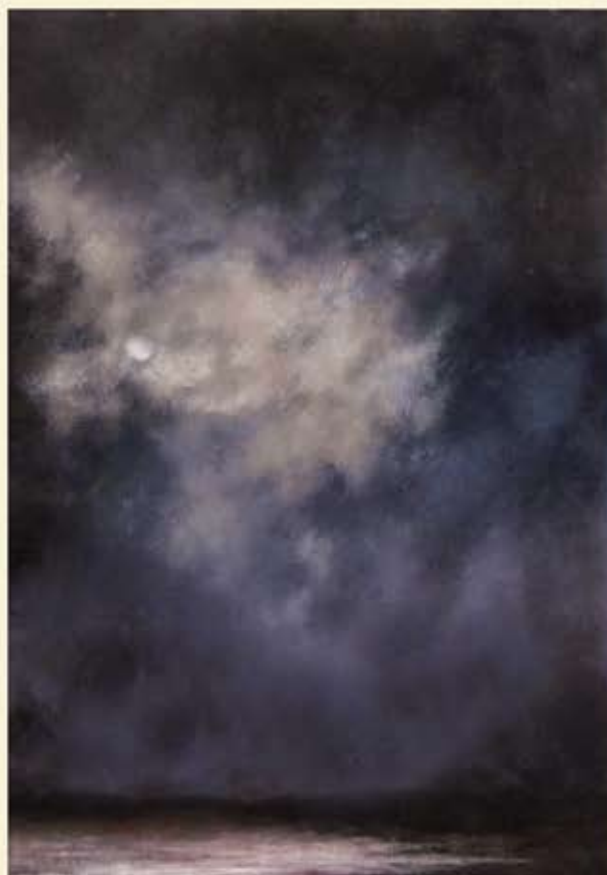
"DESERT FLOODING, CENTRAL AUSTRALIA: THE RIVER" 2018

OIL ON LINEN STRETCHER 61 cm (W) X 91 cm (H)