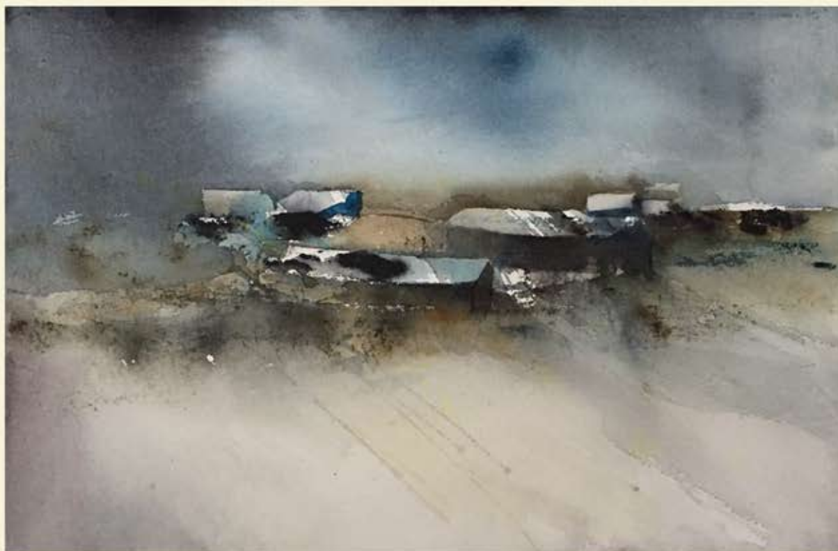
"NORDIC WINTER" 2017