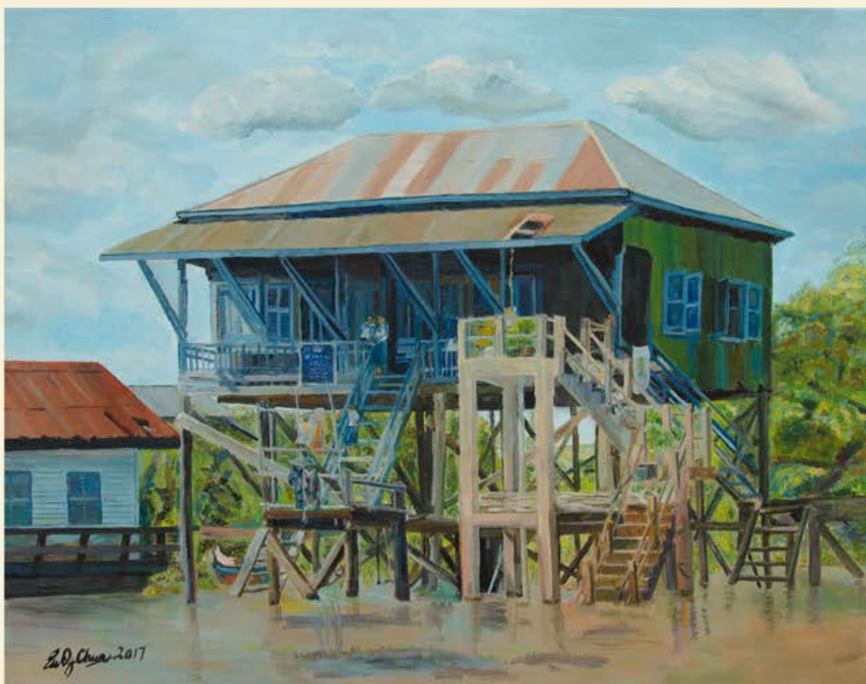
"MY SCHOOL ON THE TONLE SAP RIVER, CAMBODIA"

Currently, painting landscapes in oil is her forte. Since 2012, her works have been collected, featured in art publications and exhibited both locally and internationally. Two of her paintings have just been exhibited in the Chianciano Biennale Art Exhibition 2018.