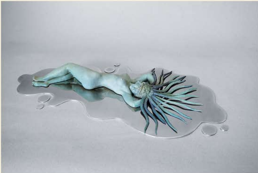
"CEREMONIAL IV (TLALOC) "