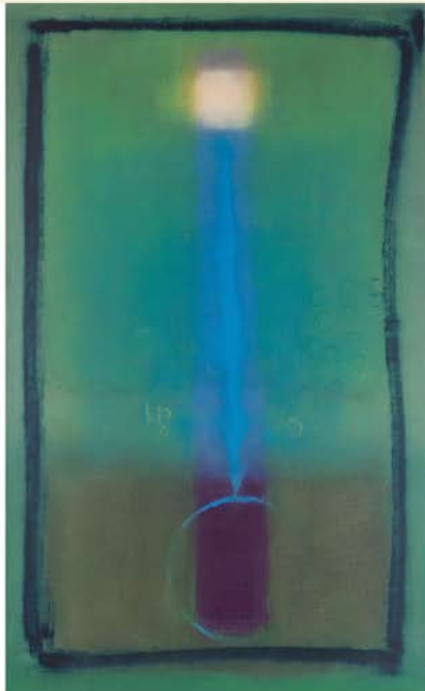
"FLUYE E INTEGRA" (Flows and Integrates) 2017