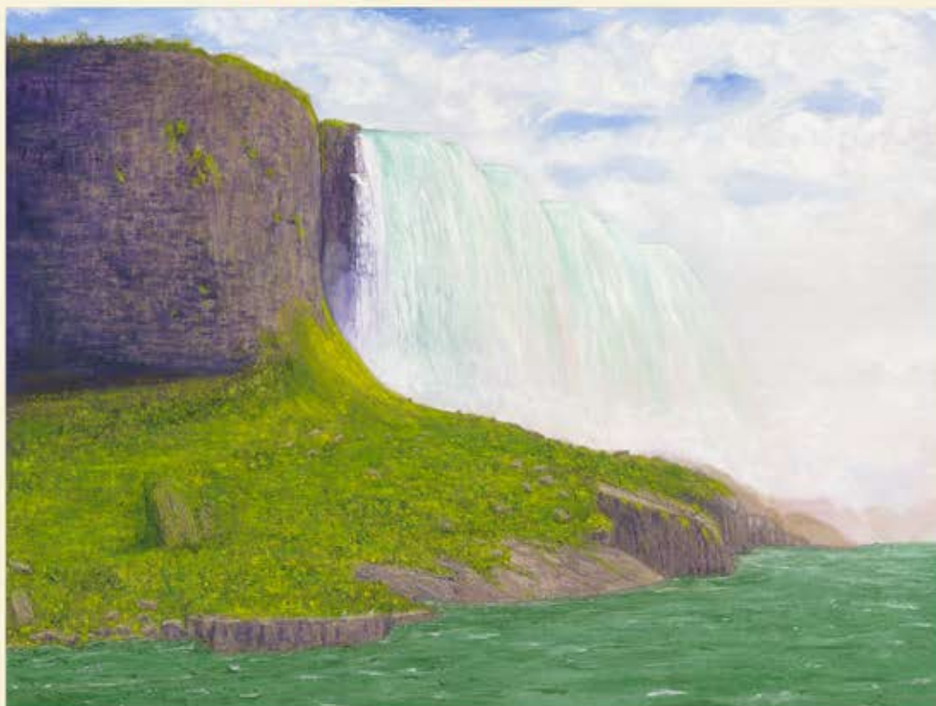
"ONGUIAAHRA" (Thunder of Waters) 2018

OIL ON CANVAS 76.2 cm (H) x 101.6 cm (W)