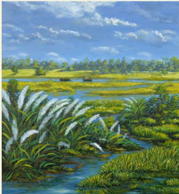
"STORY OF THE RIVER 1"